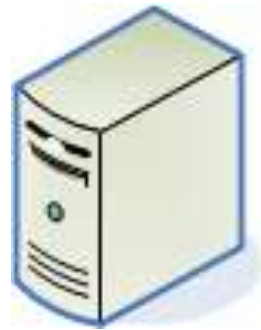
Your App Server